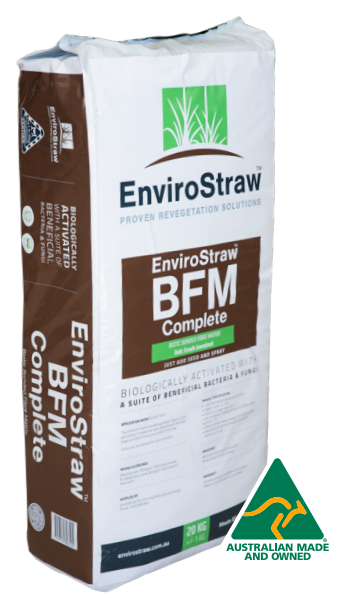
EnviroStraw BFM Complete